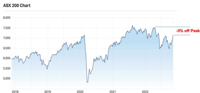
Figure 1: Australian share price index of the largest 200 stocks

What is driving the current market rally & will it last?